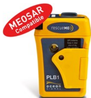
PLB1, the World's smallest PLB